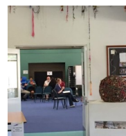
Our Voice Our Future Regional One Day Forum in Penguin.

Firstly COAG has endorsed National Principles for Child Safe Organisations, forming a national benchmark for organisations working with children and young people across sectors, with a focus on maintaining a child safe culture. This is a great start, and in time FACT hopes that this will be extended to further include a child friendly culture. Secondly, the final four asylum seeking children were flown to the US with their families for resettlement. They are the last of the 200 children who had been held at the island's processing centre.